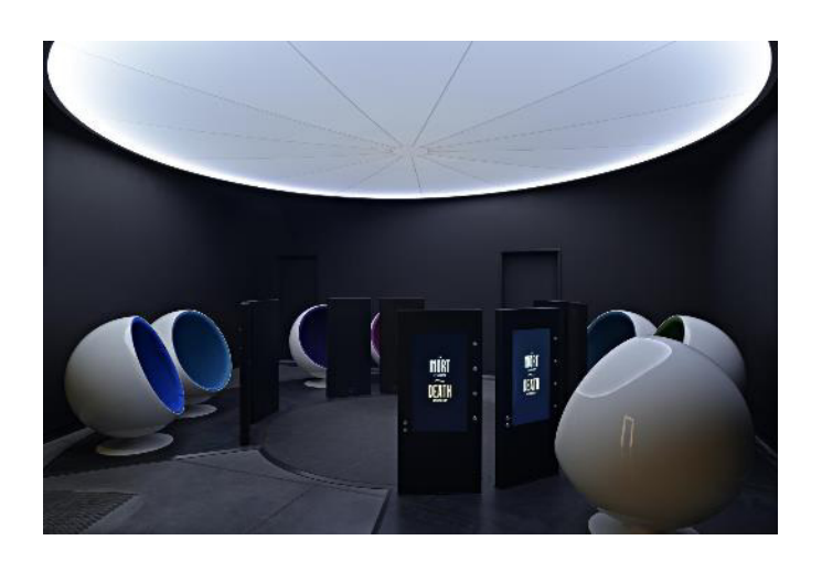
Views from the permanent exhibition, Éternités