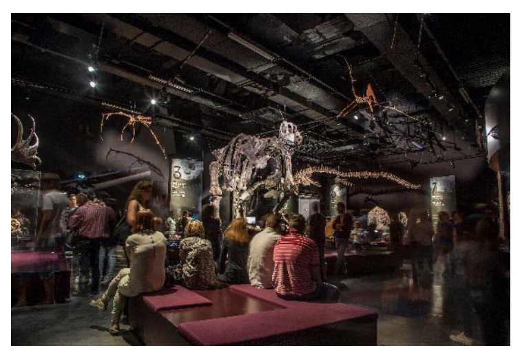
Views from the permanent exhibition, Origines