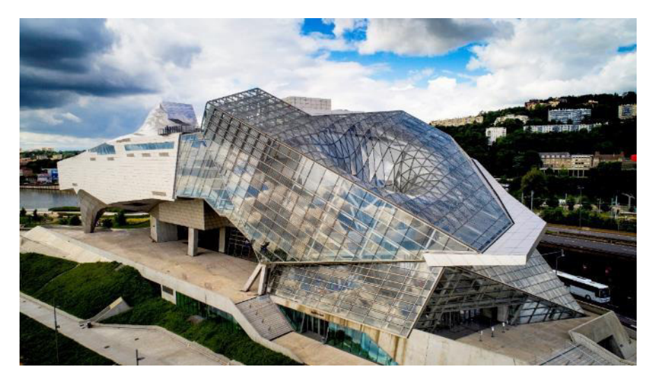
Global view of the musée des Confluences from the side of the Crystal (entrance)