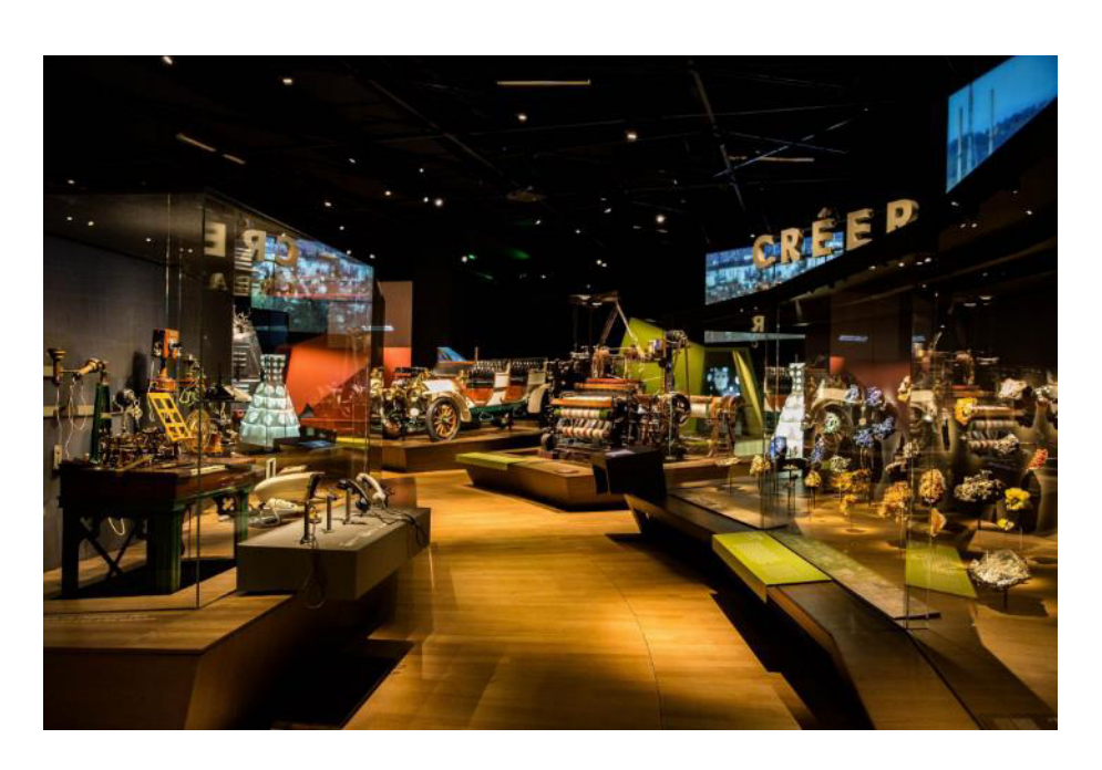
View from the permanent exhibition, Sociétés