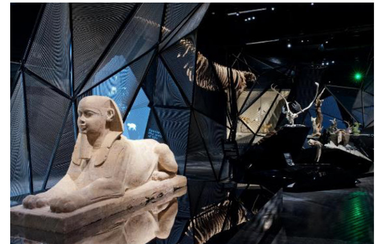
Views from the permanent exhibition, Espèces